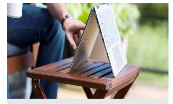
Access to <u>Asset Hub</u> (Bookmark the link for future reference)